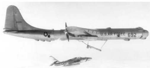
A GRB-36 Bomber launching a BFB-84 from the bomb bay.

On 4 November 1954, HQ USAF redesignated the wing as the 71st Strategic Reconnaissance Wing (Fighter) and stationed the 71st at Larson AFB, Washington. The wing performed strategic reconnaissance and also tested a technique for launching small aircraft from bombers to extend the range of photographic reconnaissance and fighter escort. The testing ended in 1956.