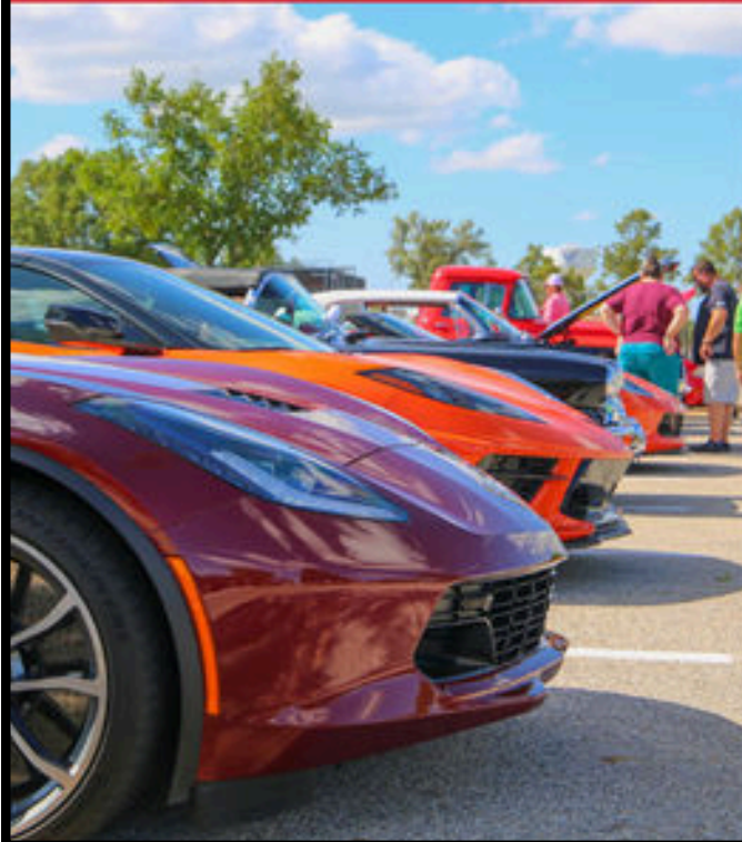
Vance AFB Demographics

71 FSS Marketing Office 100 Young Rd. Bldg. 200, Room 202 (580) 213-6459 carli.woolsey.1@us.af.mil www.hillfss.com